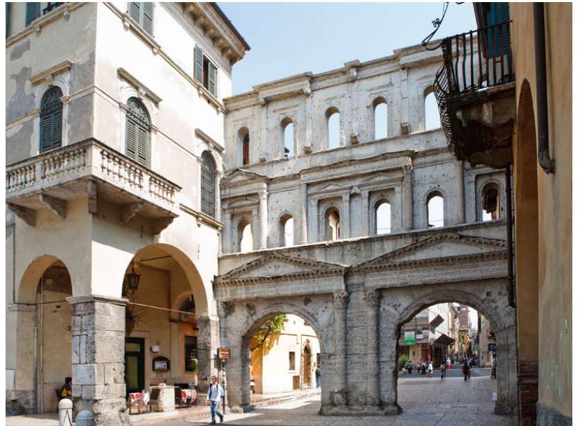
Porta Borsari (Borsari Doorway)