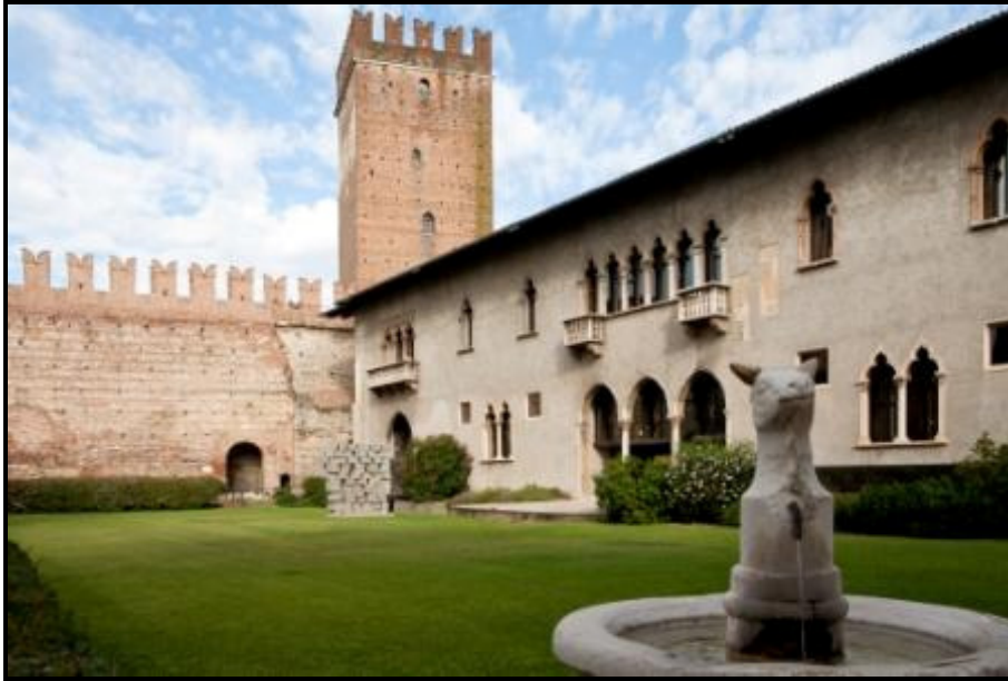
Castelvecchio (or Castle of San Martino in Aquaro)