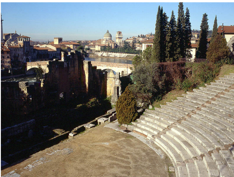
Teatro Romano (Roman Theatre)