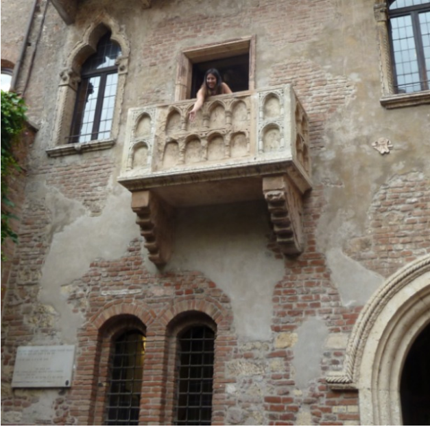
Shakespearean tragedy of 'Romeo and Juliet': the famous balcony of the Juliet's brick house at Number 23 Via Cappello