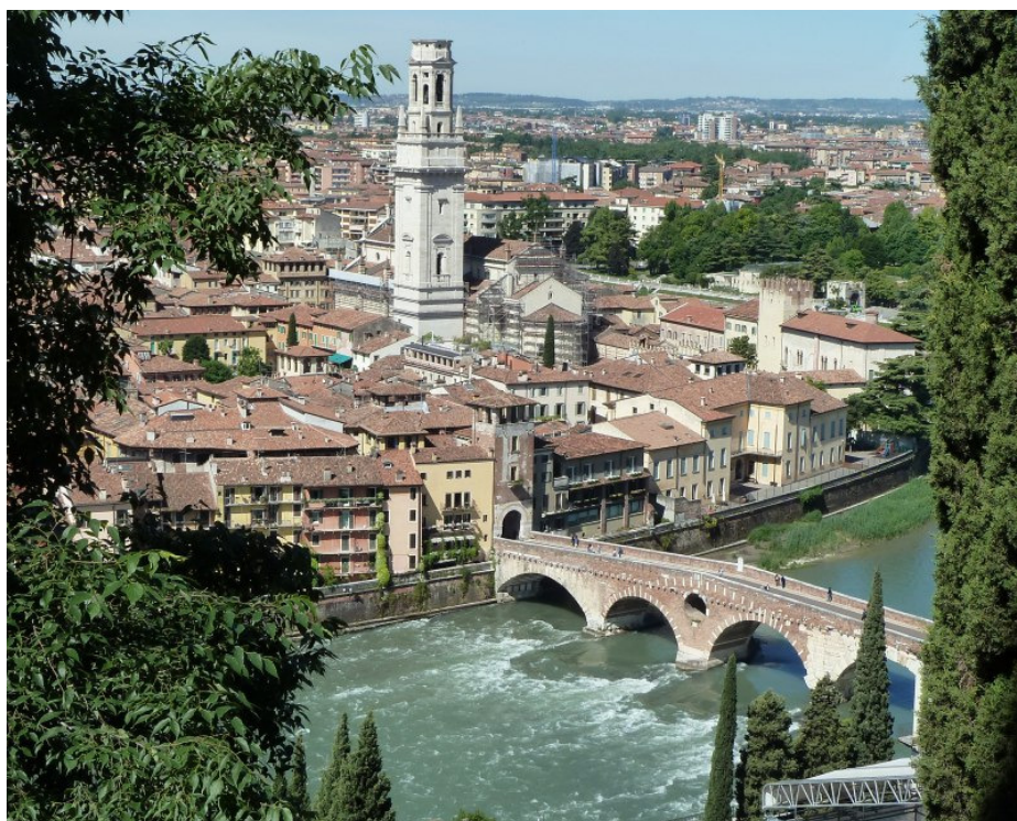
Bell Tower of the Cathedral (Duomo) and Ponte Pietra on the Adige river.

Verona is a human scale city which fascinates visitors with its elegance and its welcoming atmosphere, in which ancient and modern times meet. A glimpse of the city is love at first sight, and will entice you to come back and explore it thoroughly. Elegant cafés and ancient ‘osterie’ (typical inns of the Veneto territory), craftsman shops and high couture shops enliven city life all year.