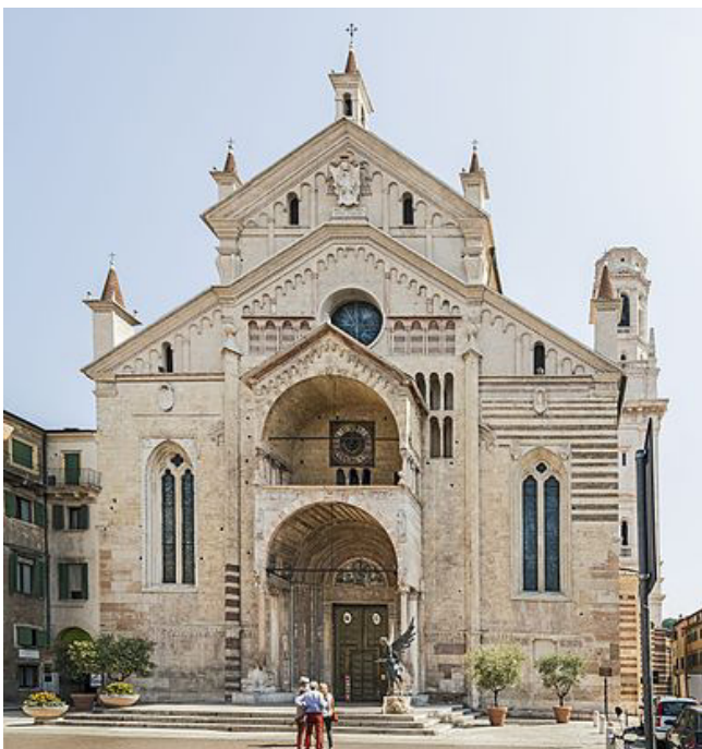
The Cathedral (Duomo)