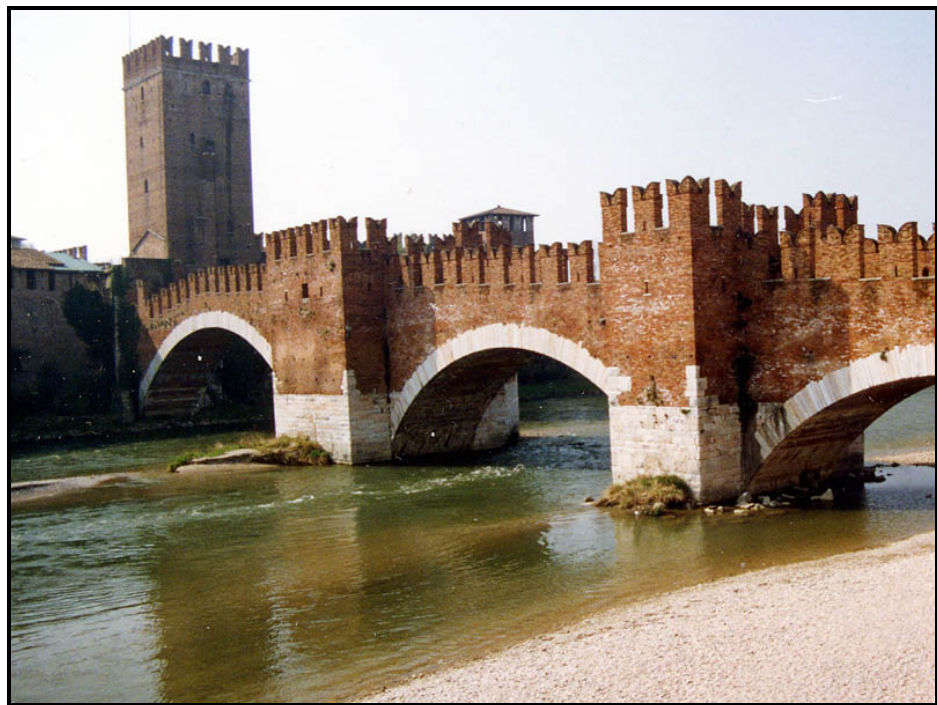
The Ponte Scaligero (Bridge of the Della Scala family, also known as the Scaligeri Seignory) starts from the main tower of Castelvecchio

Ancient churches can be admired in Verona (see next page): San Fermo, Sant'Anastasia, the Cathedral (Duomo), and others.