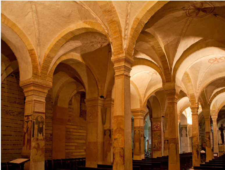
Church of San Fermo